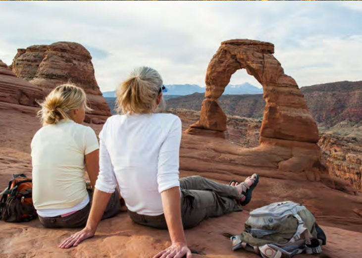
Delicate Arch, Arches National Park