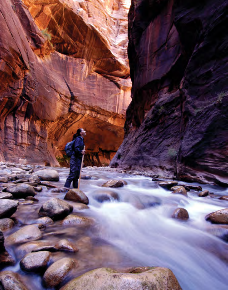
Hiking in the Narrows