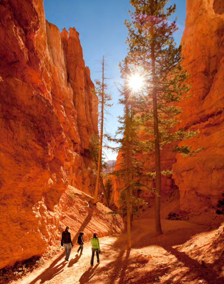
Navajo Loop Trail, Bryce Canyon National Park