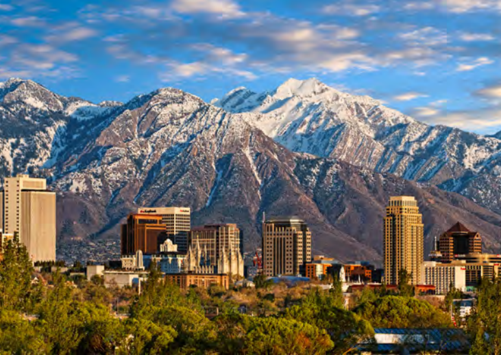
Downtown Salt Lake City