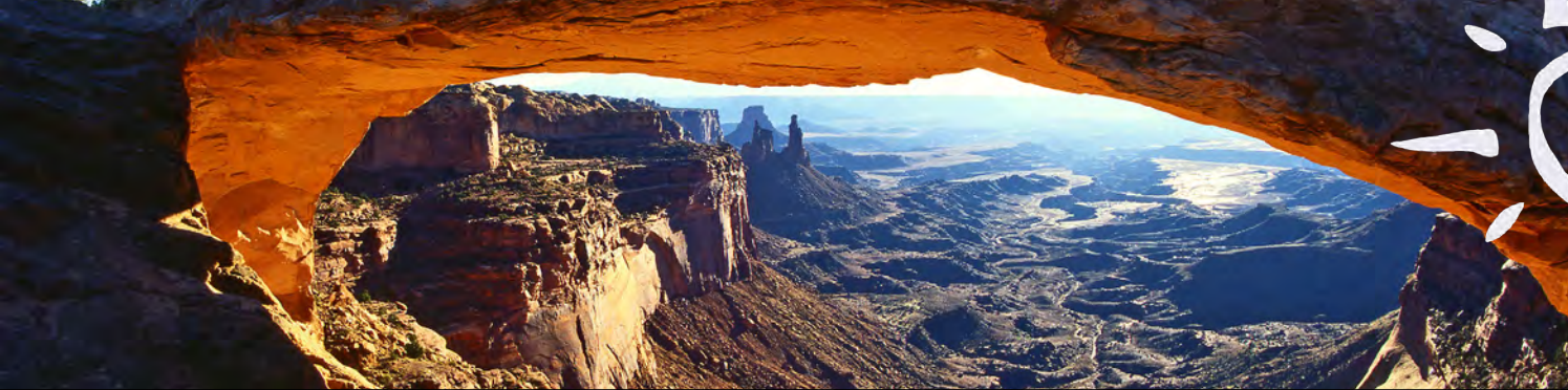
Mesa Arch, Canyonlands National Park