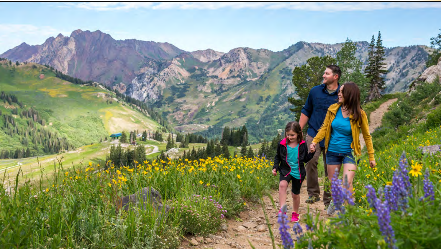
Little Cottonwood Canyon

Arches National Park Bryce Canyon National Park Canyonlands National Park Capitol Reef National Park Zion's National Park