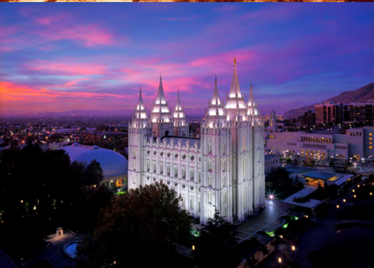
Temple Square, Salt Lake City