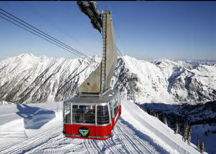
Snowbird Ski Resort

Your adventure starts with The Mighty 5® national parks (Zion, Bryce, Arches, Capitol Reef, Canyonlands); it continues with urban adventures, world-class dining and arts, historical and cultural sites, museums, multiple national monuments, recreation areas and state parks plus vast stretches of national forest and open lands filling the space between them.