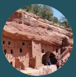
Manitou Cliff Dwellings