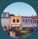
Historic Manitou Springs