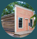
Historic Old Colorado City