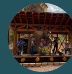
Flying W Ranch