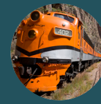
Royal Gorge Route Railroad