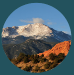
Pikes Peak America's Mountain