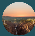
Royal Gorge Bridge & Park