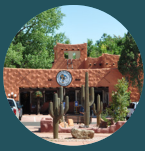
Garden of the Gods Trading Post