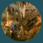
Cave of the Winds Mountain Park