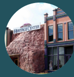
Cripple Creek Heritage Center