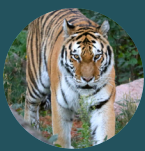
Cheyenne Mountain Zoo