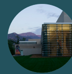
Colorado Springs Fine Arts Center