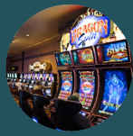
Cripple Creek Casinos