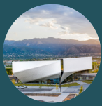
U.S. Olympic & Paralympic Museum