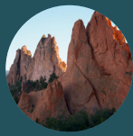
Garden of the Gods Park