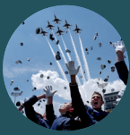
U.S. Air Force Academy