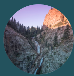
The Broadmoor Seven Falls