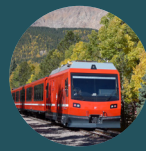
The Broadmoor Manitou & Pikes Peak Cog Railway