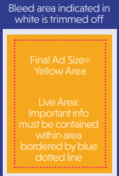
Bleed area indicated in white is trimmed off