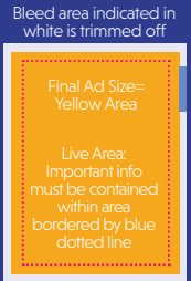
Bleed area indicated in white is trimmed off