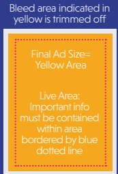
Bleed area indicated in yellow is trimmed off