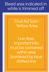
Bleed area indicated in white is trimmed off