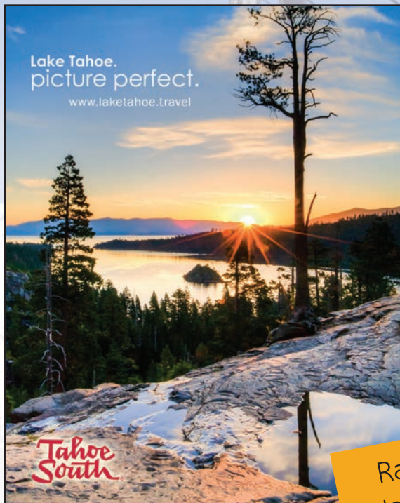
Sample Tab Divider Ad

Place an ad in the Go West Summit Resource manual as an affordable and effective way to draw special attention to your destination or business!